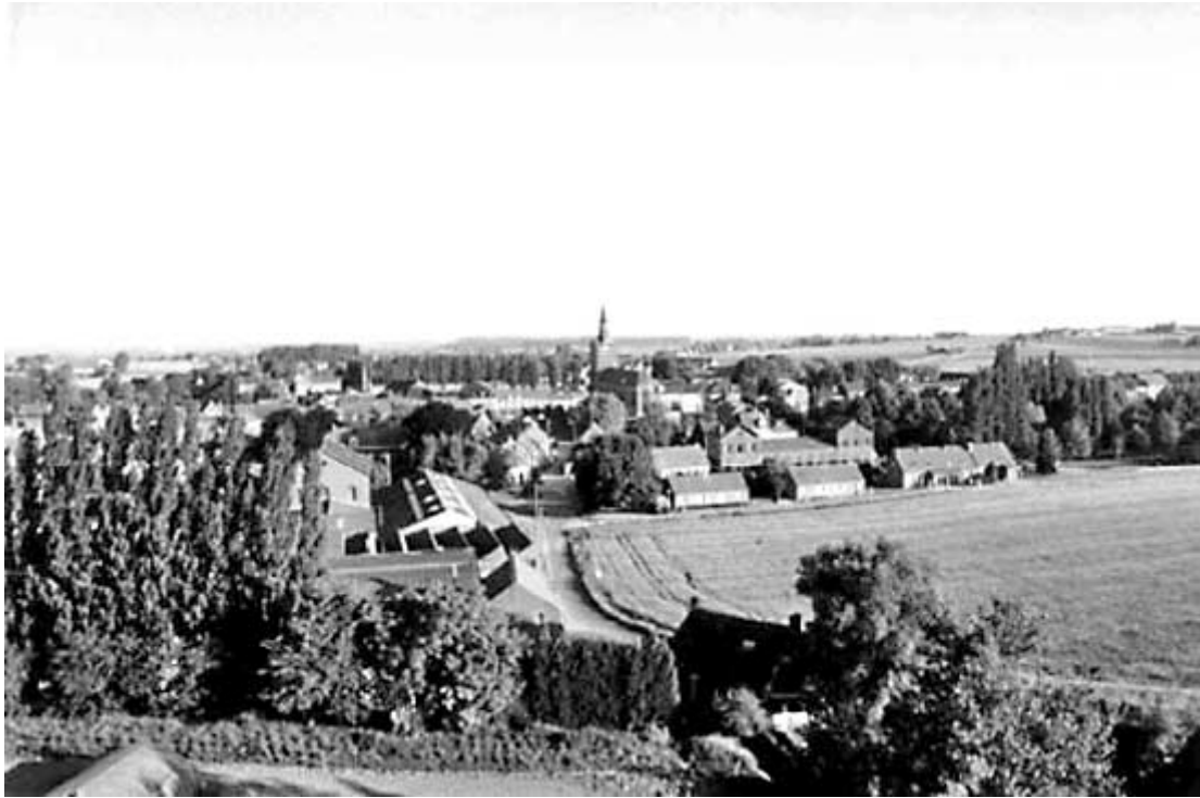
The town of Godewaersvelde