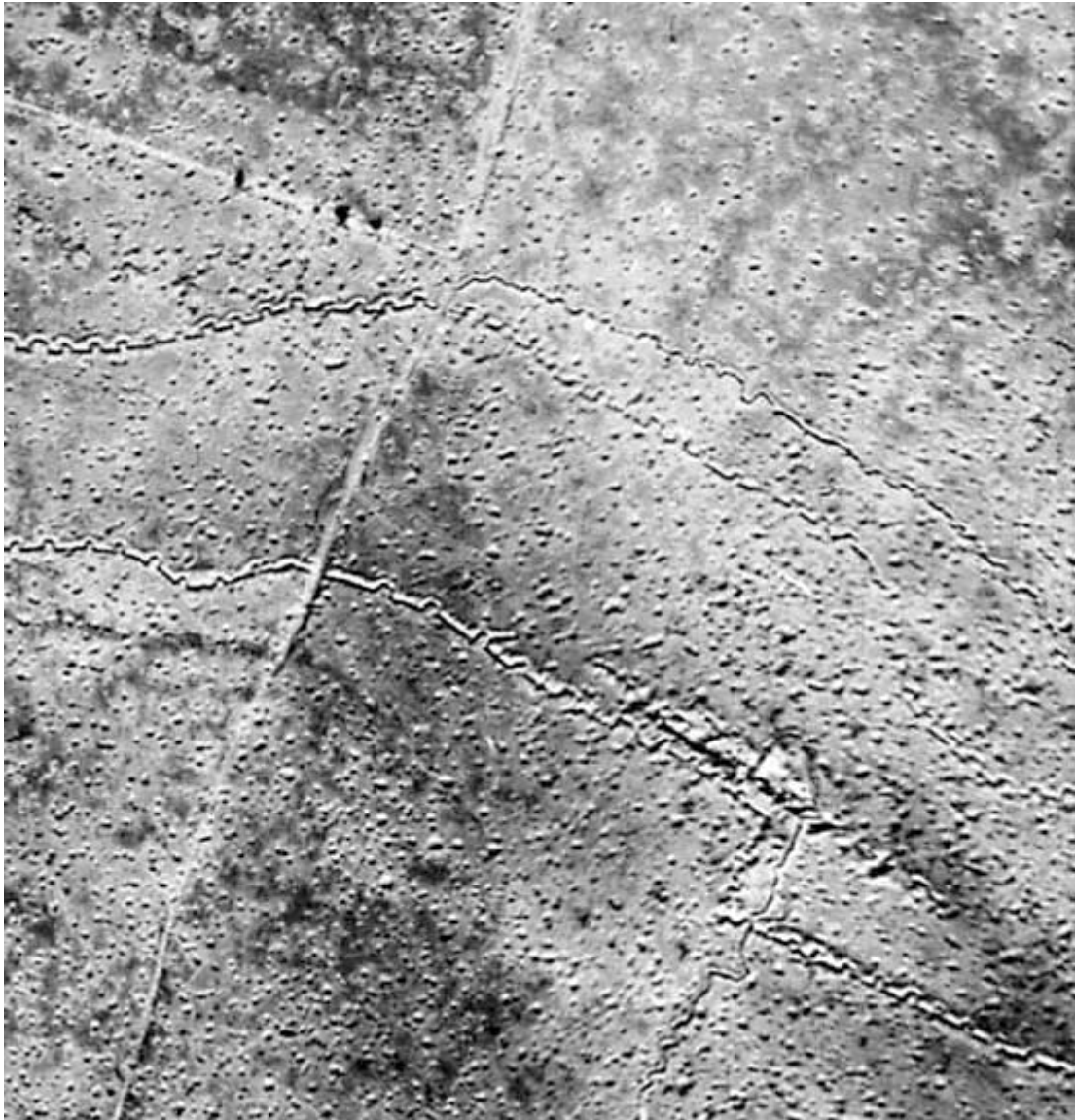
Map of Ligny-Thillois showing the trench system