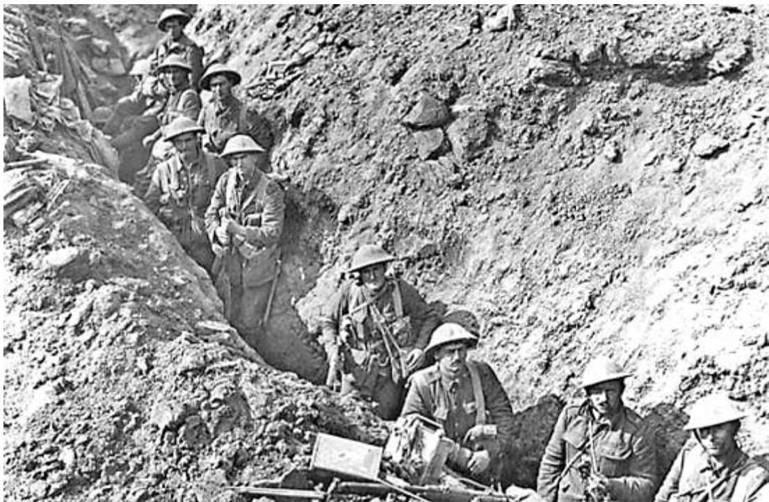
Infantry from the 2nd Battalion, Auckland Regiment, New Zealand Division near Flers.